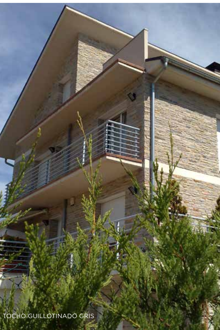
TOCHO GUILLOTINADO GRIS